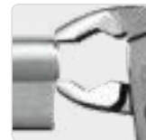
Plug pulling protection